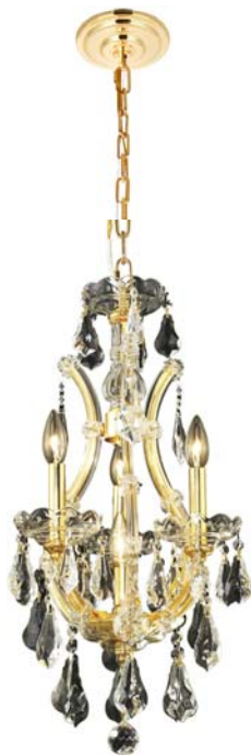
Gold Item No: 2801D12G